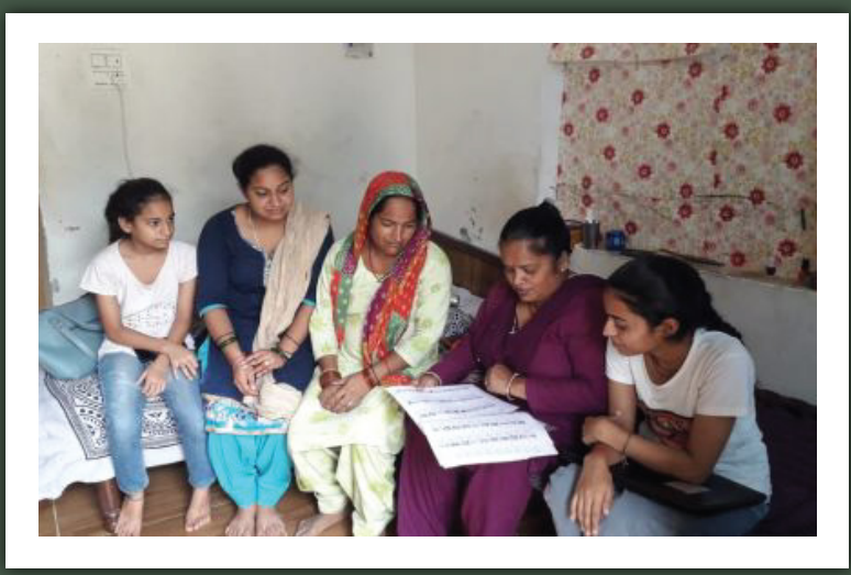
Glimpses of BLO conducting House to House survey

Removal of multiple entries, deceased voters, and permanently shifted voters